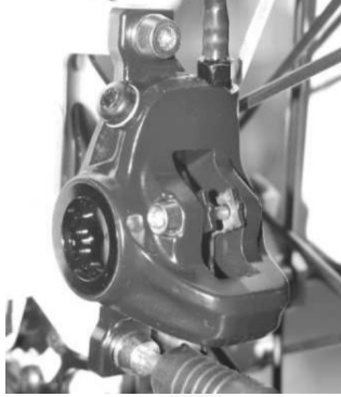
Direct mount 安裝方式