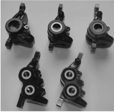
Overview caliper 卡鉗總覽